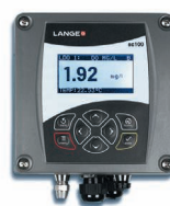
SC 100 Controller Up to two SC probes can be connected

The light source emits a high-intensity beam of light, which strikes the surface of the liquid diagonally. The detector registers the light that is scattered at 90° to the incident beam. This scattered light is proportional to the content of suspended particles in the sample.